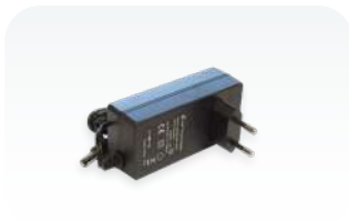
24 V 1.5 A power adapter