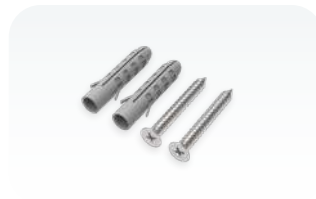
K-47 fastening set