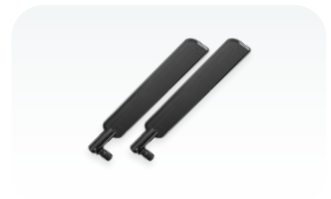
HGO indoor antenna kit