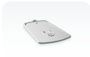
Base leg and pads